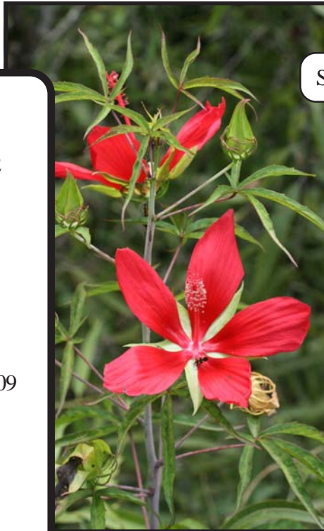
Scarlet hibiscus at Silver River