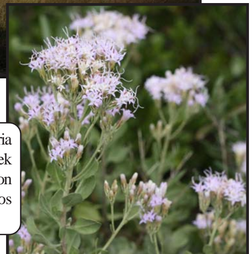
Flatwoods (above) and garberia in bloom (right) at Tiger Creek Preserve, which we will visit on our Oct. 22 field trip.