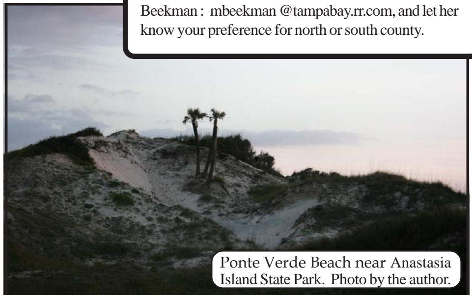
Ponte Verde Beach near Anastasia Island State Park.