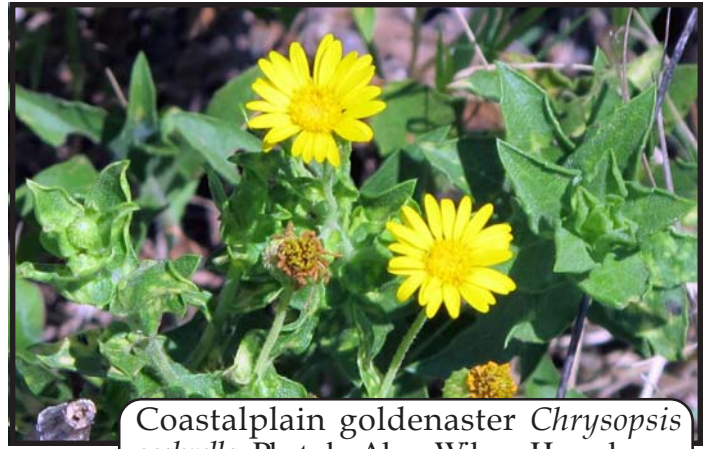
Coastalplain goldenaster Chrysopsis scabrella .

Everyone enjoyed the diversity. On the way into the addition, some saw a bobwhite quail and a Sherman's fox squirrel. We saw longleaf and sand pine trees but also, turkey oak, bluejack oak, laurel oak, myrtle oak and huge spreading live oak. Smaller trees included persimmon, a wild plum ( Prunus umbellata ) and black cherry. Some members pulled up invasive carrotwood. Craig explained that this area can't be classified as a typical pine flatwoods due to the many salt tolerant species on the property and the absence of wiregrass. Birds present were red-bellied woodpeckers, titmice, many towhees, blue-gray gnatcatchers, cardinals, mockingbirds and their cousins, the brown thrasher. Blooming were greeneyes ( Berlandiera subacalis ), tarflower ( Bejaria racemosa ), purple Bacopa, both white and purple Beauty Berry ( Callicarpa americana ) and a small morning glory ( Stylisma patens ). Not flowering, but promising a terrific show in the fall, were two Carphephorus species; the vanilla plant ( C. odoratissimus ) and the umbellate C. corymbosus . We saw a good-sized gopher tortoise, perhaps looking for the gopher apple ( Licania michauxii ) we found in multiple spots.